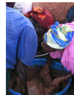
Agricultural success from the bottom up: Backyard production of shea butter by women in Burkina Faso