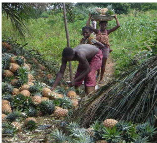
Pineapple sales, Benin

An important priority sector of NEPAD is agriculture & food security as captured in its Comprehensive Africa Agriculture Development Programme ( www.nepad-caadp.net ). CAADP is working to raise the amount and the quality of food that Africa produces to make families more food secure and exports more profitable.